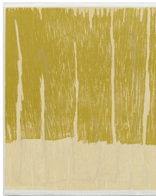
Ideas of March XIII (iii)