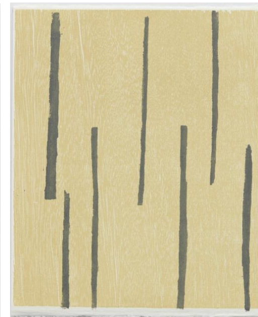
Ideas of March XIII (iv)