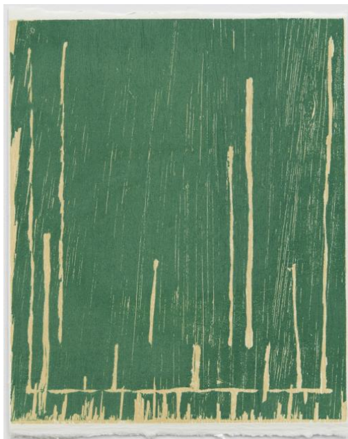
Ideas of March XIII (i)

Series of four woodcuts Sheet size: 25.5 x 21 cm (10 x 8 1/4 in) Edition of 18 Each print is signed by the artist and numbered on the reverse.