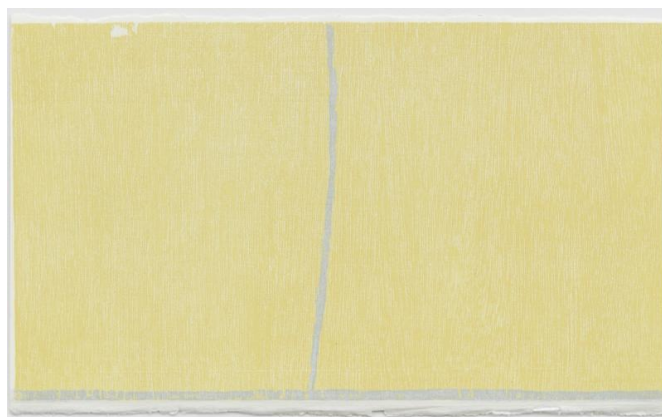
Ideas of March X (vi)