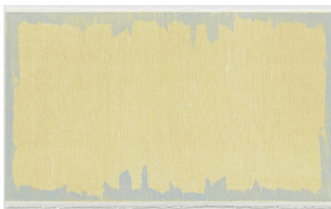
Ideas of March X (iv)