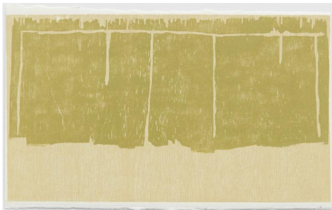
Ideas of March X (i)

Series of six woodcuts Sheet Size: 21 x 35.5 cm (8 1/4 x 14 in) Edition of 18 Each print signed by the artist and numbered on the reverse