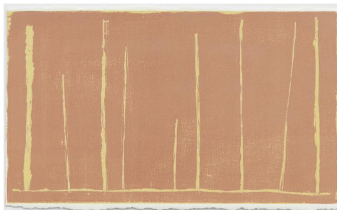
Ideas of March X (ii)