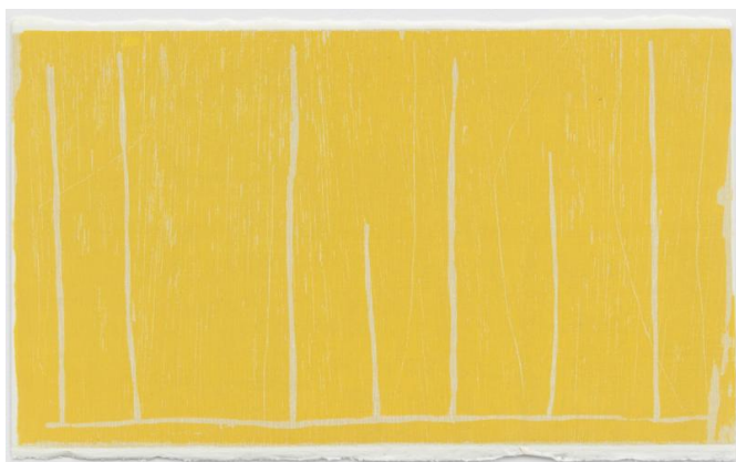
Ideas of March X (iii)