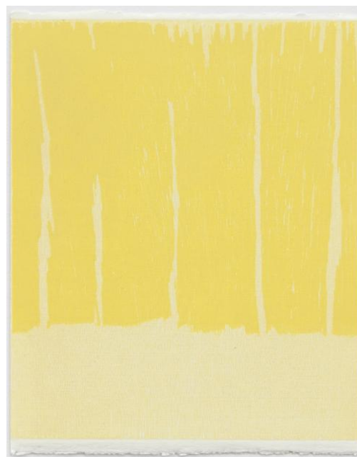
Ideas of March VIII (iii)