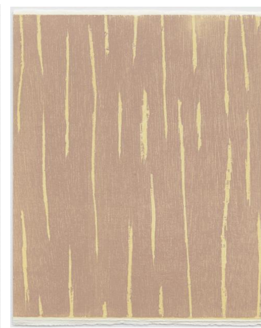
Ideas of March VIII (iv)