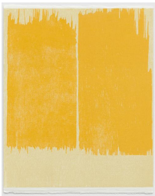
Ideas of March VIII (i)

Series of four woodcuts Sheet size: 25.5 x 21 cm (10 x 8 1/4 in) Edition of 18 Each print signed by the artist and numbered on the reverse