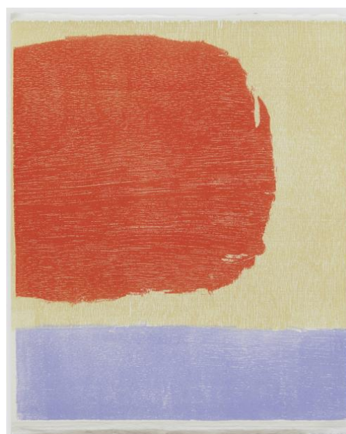
Ideas of March VI (iii)