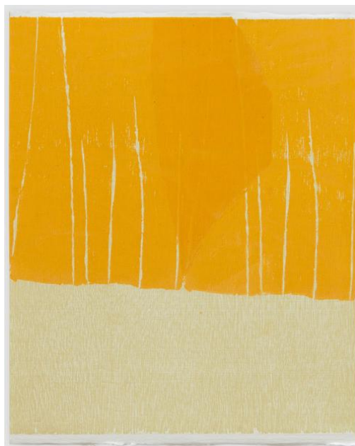
Ideas of March VI (ii)