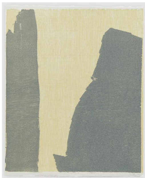
Ideas of March VI (i)

Series of four woodcuts Each print signed by the artist and numbered on the reverse Sheet size: 25.5 x 21 cm (10 8 1/4 in) Edition of 18