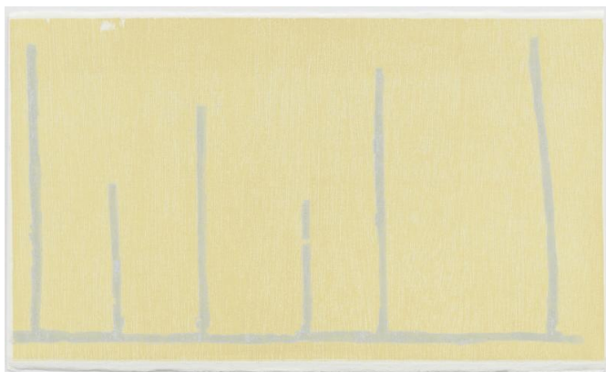
Ideas of March IX (iii)