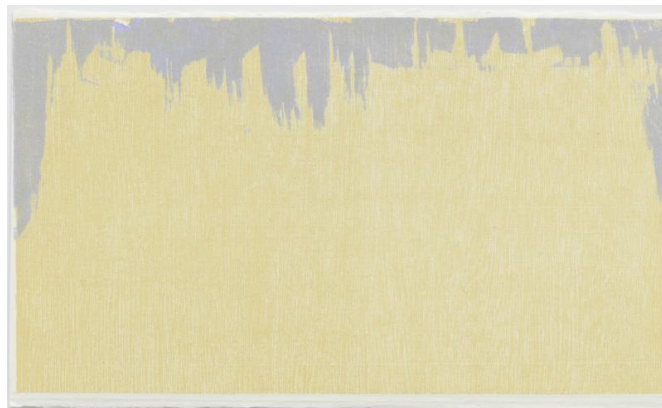
Ideas of March IX (iv)