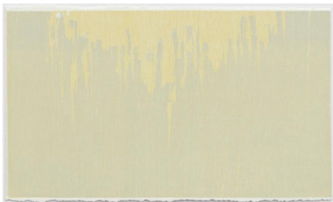
Ideas of March IX (i)

Series of four woodcuts Sheet size: 21 x 35.5 cm (8 1/4 x 14 in) Edition of 18 Each print signed by the artist and numbered on the reverse