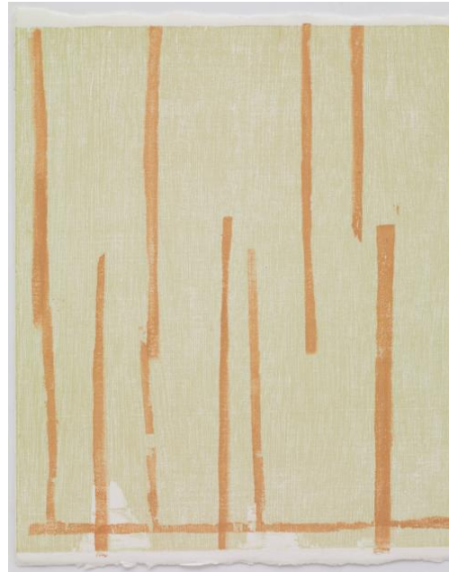
Ideas of March I (iii)