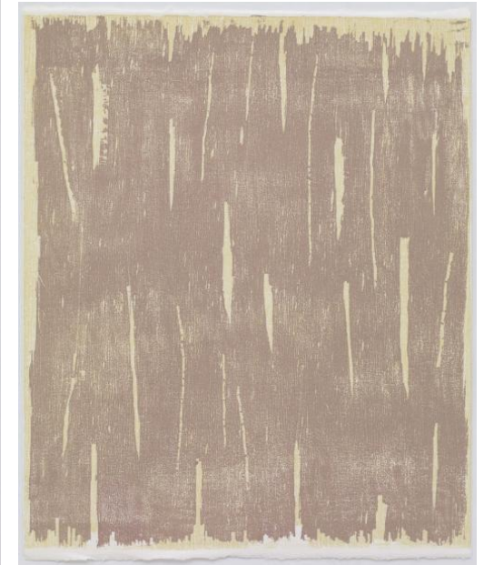
Ideas of March I (iv)